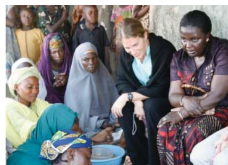
Sylvia Mathews Burwell, president, Global Development Program (second from right), listens to a microfinance group in Nigeria.