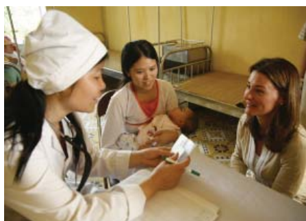
Melinda French Gates, co-chair and trustee (right), listens to a doctor at a health clinic near Hanoi, Vietnam.