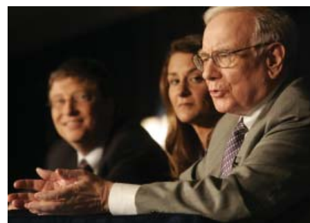
Warren Buffett, trustee (right), speaks to the media in New York City after announcing his historic gift to philanthropy.