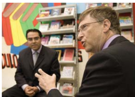
William (Bill) H. Gates III, co-chair and trustee (right), meets with officials in the Batallón de San Patricio Public Library in Mexico City.