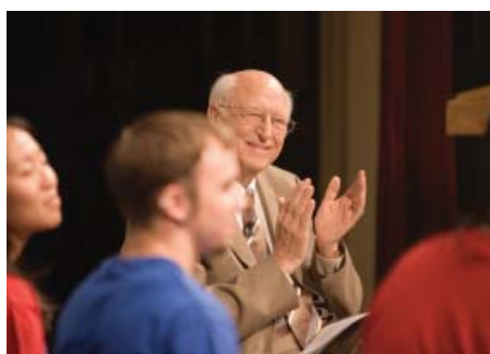
William H. Gates Sr., co-chair (center), celebrates the fifth anniversary of the Washington State Achievers Program.